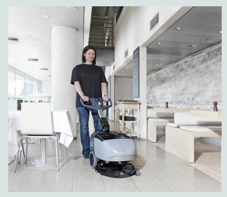
Low sound level allow daytime cleaning in sound sensitive areas