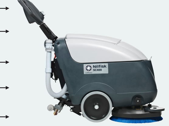
High performing Polyurethane squeegee blades as standard

Two knobs beneath the tanks allow simple adjustment of the deck angle for full traction control