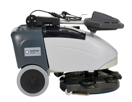
Thanks to the compact design and foldable handle, the SC351 is easy to transport and store, even when space is limited