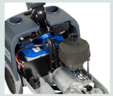
The powerful brush motor is designed for maximum reliability and cleaning performance