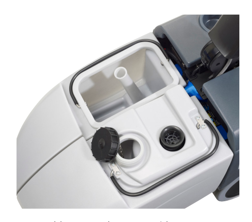
Removable two tank system with transparent plastic lid and rubber protected handles makes them easy to carry