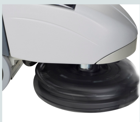
The unique rotating deck and 27 kg brush pressure enable SC351 to clean and dry both forward and backward reaching even the most inaccessible places